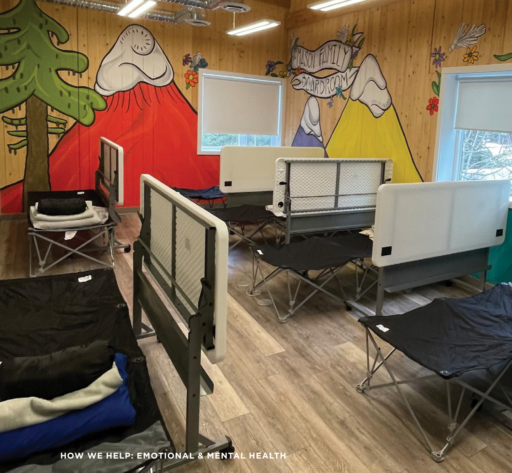
HOW WE HELP: EMOTIONAL & MENTAL HEALTH